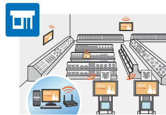
Shopping / Retail