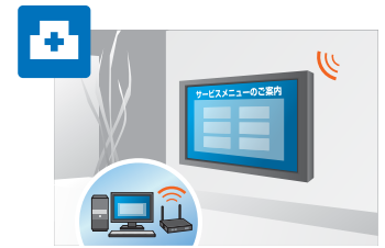
Hospital / Medical