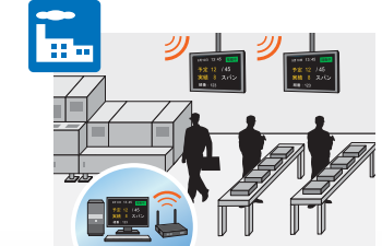
Manufacturing / Warehouse