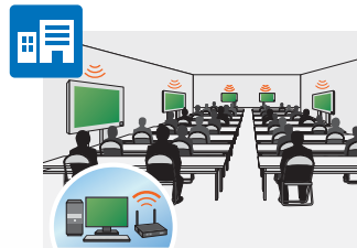
Office / Education